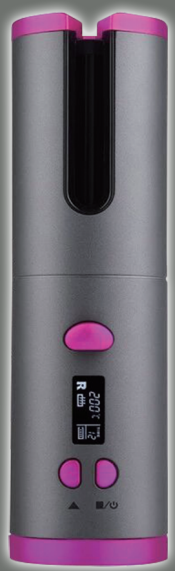
2 IN 1 Wireless Automatic Hair curler With Power Bank

Lithium Battery:5000mAh Charging Volt: DC 5V Charging Current: max.2A Charging time: 3 hours @charging current is 2A@25°C Output Volt: DC 5V Output Current: max.2A Working time:60min@180°C